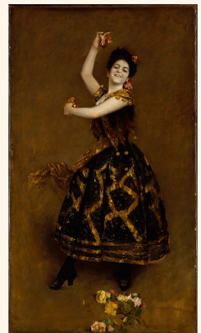
Title: Carmencita Artist: William Merritt Chase, (1890) Location: The Metropolitan Museum of Art, New York License: Public Domain