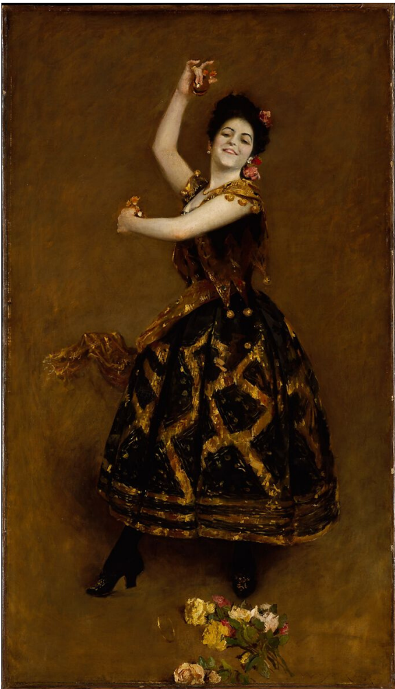
Title: Carmencita Artist: William Merritt Chase, (1890) Location: The Metropolitan Museum of Art, New York License: Public Domain