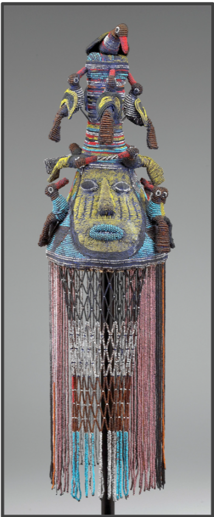
Title: Yoruba Crown Artist: Unknown (abt. 1920)