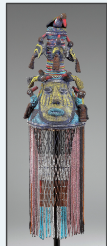
Title: Yoruba Crown Artist: Unknown (abt. 1920) Location: Minneapolis Institute of Art License: Public Domain