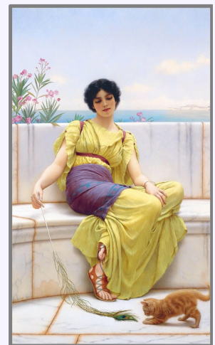
Title: Idleness Artist: John William Godward, (1900) Location: Private Collection License: Public Domain