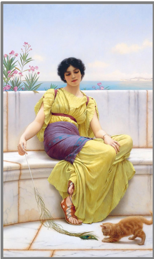
Title: Idleness Artist: John William Godward, (1900) Location: Private Collection License: Public Domain